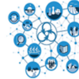
Process Systems / Systems-thinking