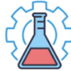
Chemical Eng Science